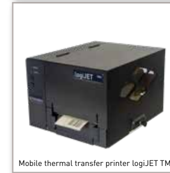
Mobile thermal transfer printer logiJET TM4