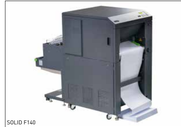
Microplex products for use in IPDS printing environments.