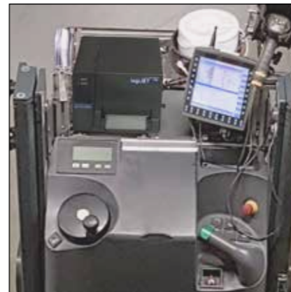
logiJET TM4 - mobile use on industrial trucks