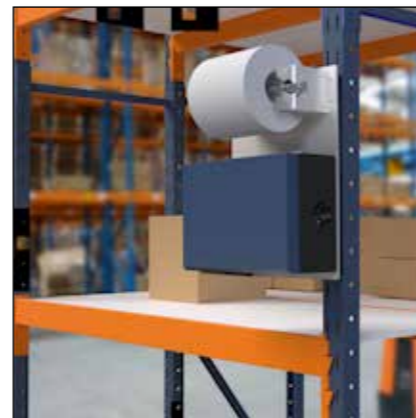
logiJET TM8 - position-independent installation